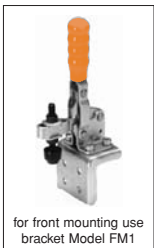
for front mounting use bracket Model FM1