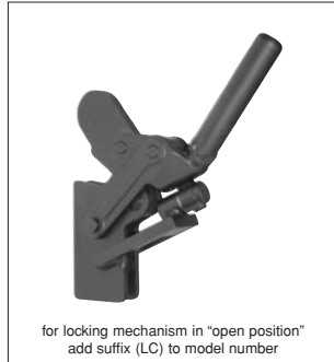
for locking mechanism in "open position" add suffix (LC) to model number