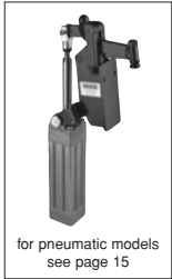
for pneumatic models see page 15

All dimensions not shown remain as per VA1200T